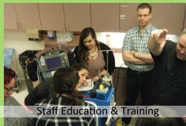
Staff Education & Training