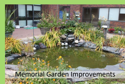
Memorial Garden Improvements