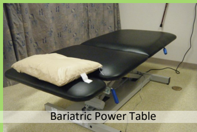
Bariatric Power Table